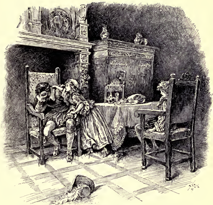
Cicely darted to his side with a frightened cry.